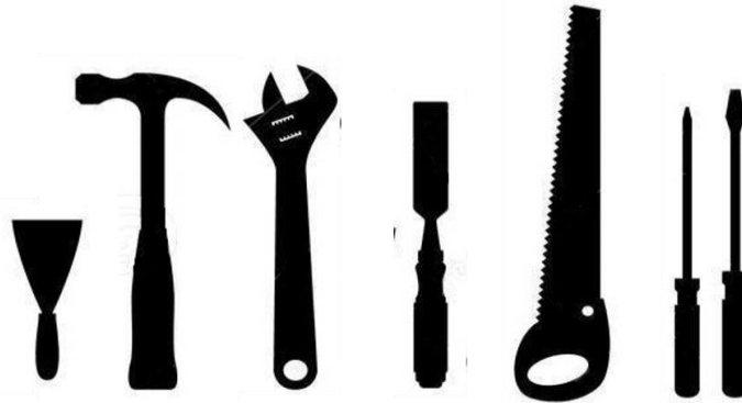
Figure 1. Question for the written examination task: Identify three (3) examples of technology in everyday life in the picture (draw circles). Use the rubric below as support for answering the question. (Only a part of the original picture is reproduced here.)

described (Figure 1). This task was assessed with a rubric (Table 1). The other was to design pedagogic technological activities in preschool. (Rubric, one full page, not included here).