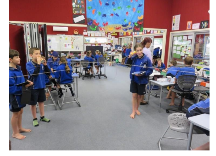
Figure 1. Student workstations in the ILE