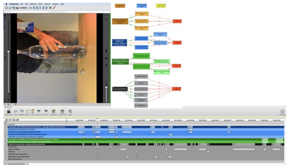
Figure 2. Studiocode timeline showing Okiwibook video scaffold (top left), the coding template (top right) and the code timeline (bottom).