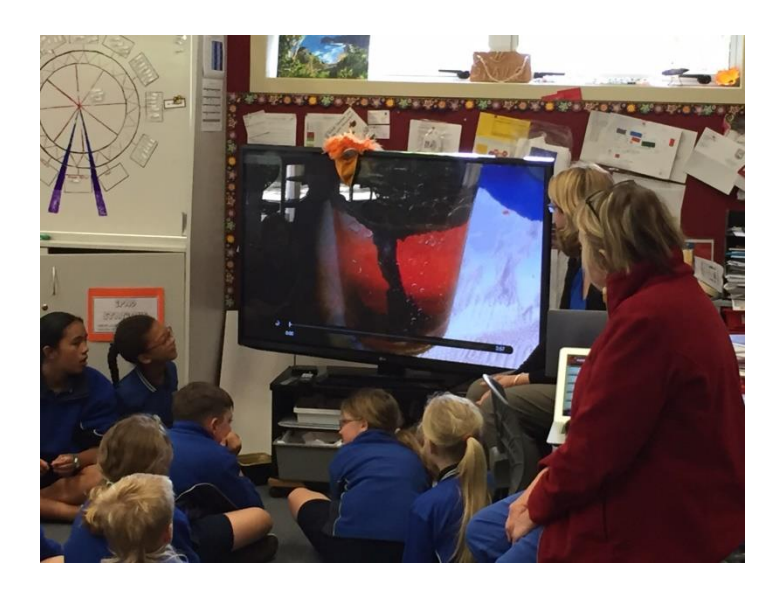
Figure 4. Students used Apple TV to share recordings during class plenaries

recordings were also valuable during class plenaries where teachers got students to discuss their methods and results. Students broadcast their recordings via Apple TV (Figure 4), using them as visual aids to explain what they did and their developing science understandings. The plenaries were an important opportunity for teachers to ensure students were constructing accurate science knowledge. They used them to clear up misconceptions and discuss, in 'child-friendly' language, scientific explanations of experiment results. However, this required the teachers to thoroughly research the concepts themselves, in preparing for this topic. Interestingly, while the apps contained textual scaffolds summarising the main science concepts, very few students read these. Data suggested this was due to the complexity of language used, and the length of the explanations. As one student commented, "maybe they could've had an option on the video... you could press a button and they could explain what's going on while you're watching it..." (student A, 1.33:45). Feedback like this indicates app developers should be cognisant of how accessible scaffolds are to their target groups.