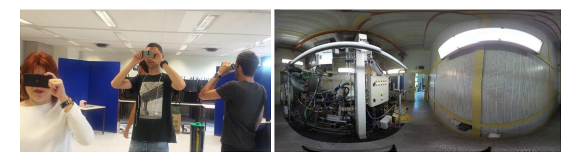
Figure 5: Virtual reality visit of a test bench