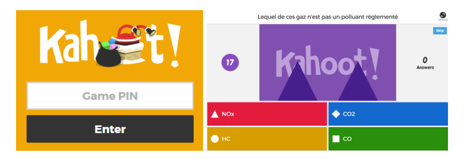
Figure 4: Kahoot Quiz

The quiz boxes provide a fun activity that help the teachers get feedback on the learning acquisition. The teacher needs to prepare the quiz in advance and the names of the students need to be registered so a personalized follow up of each student can be done. In case where the teacher wants simplified logistic, the Kahoot platform offers other possibilities (<u>https://getkahoot.com/</u>). In this case, the quiz is recorded in the Kahoot platform and the students log in the game with a game pin. The game can be played with any device with an internet connection (smartphone, tablets, PC). Since all of our students have a smartphone nowadays the logistics is simplified with the additional advantage of increasing the student's attention.