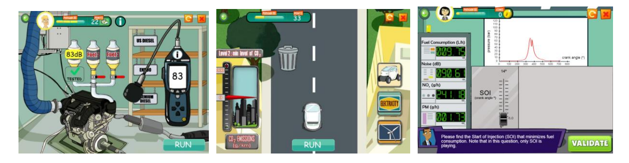
Figures 2: Serious game for powertrain

in this way asked to find the settings that provide the lowest fuel consumption or pollutant's emissions. This exercise prepares them well for the practical work: since engine testing is very expensive, we make sure they get the most out of it by making the exercise with the game before actually going to the test bench.