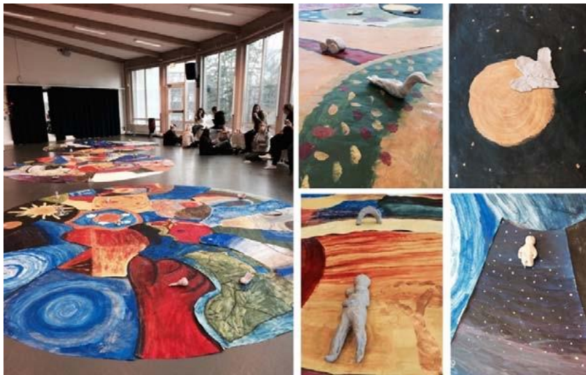
Figure 1. Closing of workshop with artefacts created by pre-service preschool teacher students spring 2016.

We used an Intermodal Arts model consisting of a five-part psychokinetic imagery process looping and moving through the three levels of awareness and response whilst addressing the subject matter.