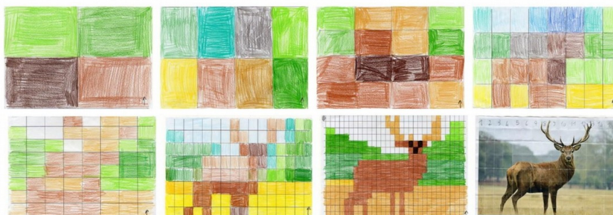
Figure 3 – Example of an image “pixelated” by the children

In the second part of the activity, each group is given a colour image and a transparent baseplate for Lego-type bricks. The plate has to be transparent, so that the image under it is well visible. The kids will also have different sized and colour bricks (4x4, 2x2 and 1 button) and will try and reproduce the image using the different sized bricks as pixels, choosing the colour that best represents each image portion. First, they will use the 4x4 bricks, so to realise that the image resolution they get is too poor to even understand what it is about; then they will try the 2x2 and finally the 1x1. Also student can try this activity individually, using images and sheets with grids of different sizes (resolutions), colouring each cell of the grid with a single colour, chosen in order to be the most representative of the “overall” colour of the box (in this case the range of possible colours is given by the ones already owned by the students). This can add an occasion of re-thinking and different perspective to the team work with bricks (Fig. 3).