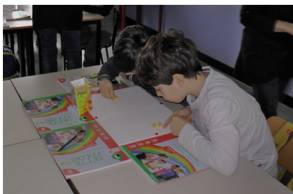
Figure 1 Children starting to put pegs in the pegboard