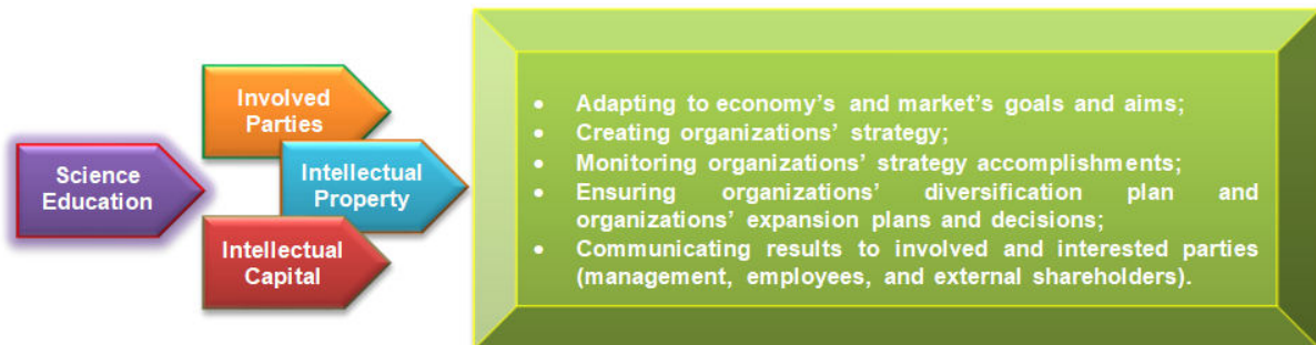
Legend: This figure describes a scientific model capable to value intellectual capital