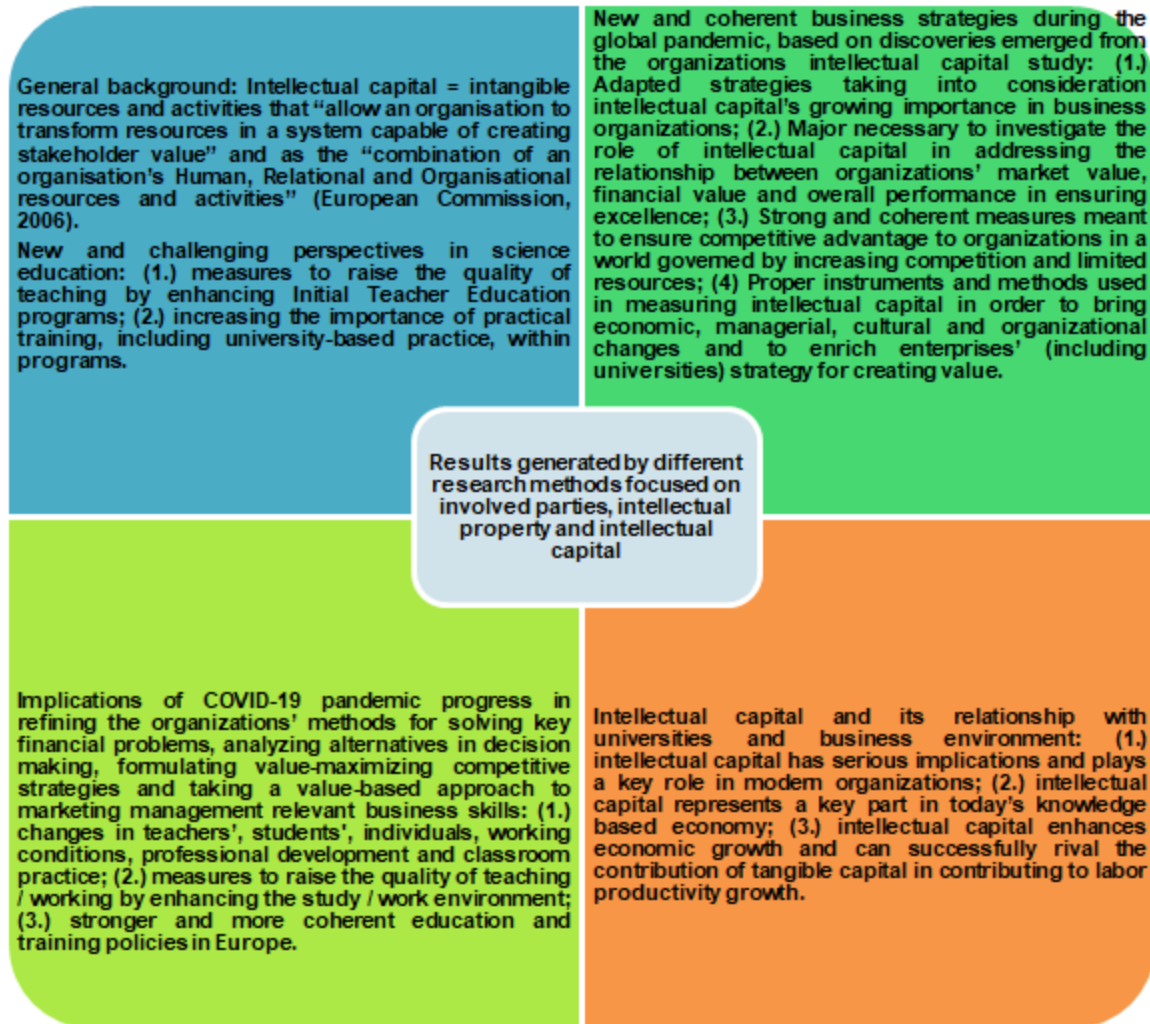
Legend: This figure underlines new and challenging perspectives in science education and steps identified in intellectual capital study in both public and private higher education institutions in Romania.