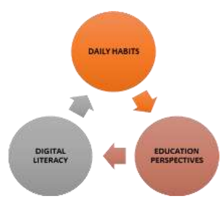
Figure 2 patient's daily categories