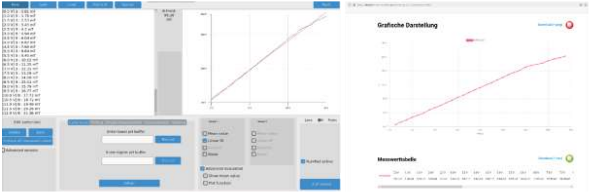
Fig. 2: LabPi's Graphical User Interface (left) and the online platform COMPare (right).

The LabPi software of the same name was developed to operate the sensors. This enables the acquisition of measured variables without having to perform further programming on the device. It has a user interface tailored to teaching, which was developed specifically for the Raspberry Pi, and is able to record processes (such as time measurements) at the touch of a button or automatically, while being displayed in tabular and graphical form. The curve progressions and measurement data can then be compared directly in the software, exported to a USB stick for calculation programs or to the online platform COMPare (Fig. 2) [6].