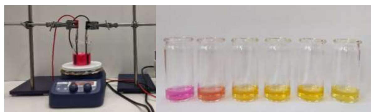
Fig. 1: Experimental Setup (left) and color change of the reaction mixture during electrosynthetic bromination shown on samples taken after 0, 3, 5, 7, 9 and 15 minutes, respectively (right).

Observations: The initially pink solution changes its color to red, then orange and later to yellow as shown in Figure 1.