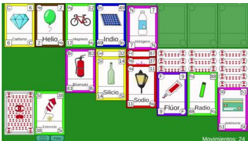
Figure 4. Example of a game to illustrate the rules of the game at the initial level.

The cards from the six columns and those uncovered from the deck, when movements are not possible, can be moved among the six piles following these two rules: