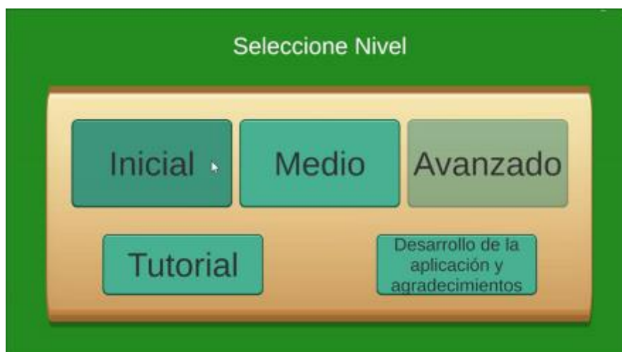
Figure 1. Access Interface of the Periodic Table Solitaire Game.

The mobile application consists of two interfaces: a first access interface and a second main interface. Upon registration, users access the first interface, which comprises five buttons (figure 1). The first three buttons allow the player to choose the game level as beginner, intermediate, or advanced. This interface also includes a tutorial button with game instructions and another button providing information about the application's development and acknowledgments.