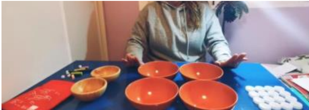
Fig 5. PST who proposed a context in the previous study (Arnal-Bailera & Arnal-Palacián, 2023)

None of the PSTs carried out any written contextualized task in the sense of presenting a word problem to solve, however student #27 used implicitly a context without presenting a word problem. In the task recorded on video, 18.5% of the students proposed a problem to solve in order to explain the task, with the distribution of candies among children being the most common context (Fig 5).