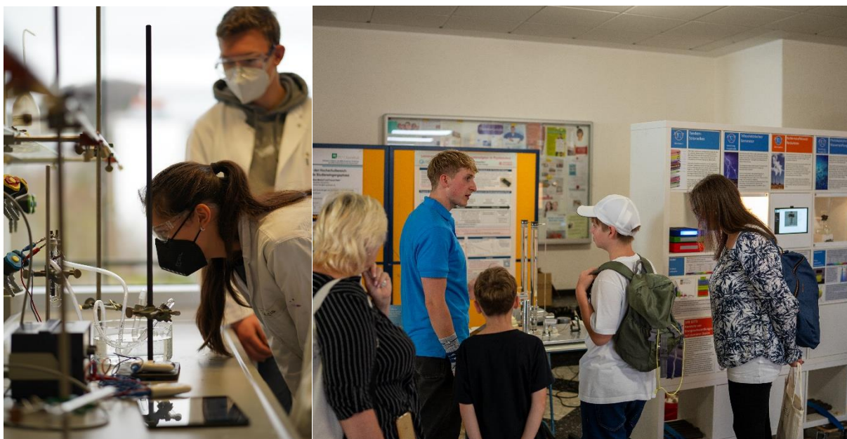
Figure 1. Examples from previous public outreach projects for formal education (Course at the XLAB, left) and the interested public (exhibition at a science fair, right).

The planned public outreach activities will be developed in jointly supervised bachelor and master theses and in workshops with PhD students. They will be designed with respect to preconceptions of the selected target group, applicable educational standards, the learning environment and expectations of the audience, respectively. The science outreach advisory board will support the public outreach team in identifying topics suitable and relevant for outreach measures. These include research questions of general interest in the context of sustainability and scientific results reported in recent publications from CRC researchers. They will be selected with scientific advice from the involved project concerning the possibility to develop adapted and simplified experiments and other materials while preserving scientific correctness.